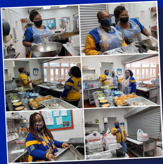
Sorors hosting dinner for the residents of the Manassas SERVE Campus