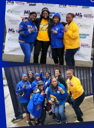
Sorors supporting the 2022 March of Dimes Walk for Babies. The chapter exceeded its goal of $2,022 by more than $1,000