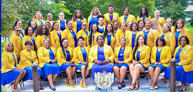
Spring 2022 Issue